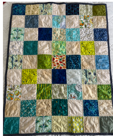
Above is one of many quilts created by Stitchery members.