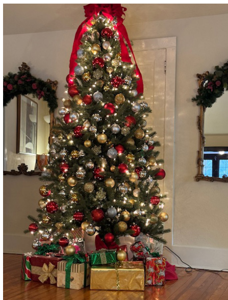
The tree on the stage added to the festive holiday ambience.