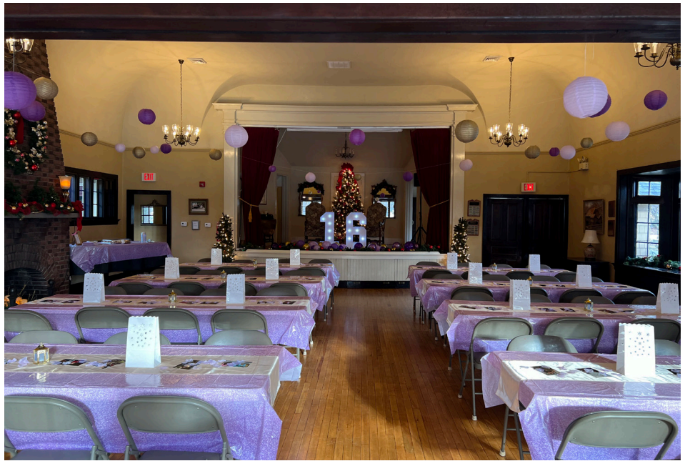
The Porch Club looking beautiful set up for a December birthday party.

The Rental Department oversees renting our clubhouse to club members and the general public for private parties. Our department answers rental questions submitted to our website, tours prospective renters through the clubhouse, manages paperwork required for rentals, and welcomes renters on their party day. We also inspect after rentals. Rental income provides operating and maintenance funds for our building. Rentals made $25,000 for the club in 2024. We welcome new volunteers!