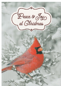
Beautiful Christmas cards brought cheer to the residents of Riverview Estates.