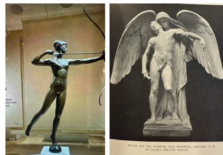
Two of the many sculptures at the "Monuments and Myths" show.

The two prominent and incredibly talented sculptors were Daniel Chester French and Augustus Saint-Gaudens. These two men were friends and rivals who created many of the country's most famous public artwork. We were amazed at the quality and quantity of these pieces in this show. There were so many beautiful examples of their monuments and memorial pieces. We enjoyed this show so much and were so lucky that the museum was within driving distance.