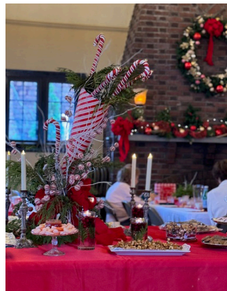
Arts Creative Department members did a wonderful job with the holiday decorations.