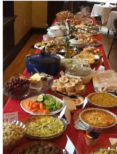
Members of the club graciously donated delicious international dishes for this special luncheon.