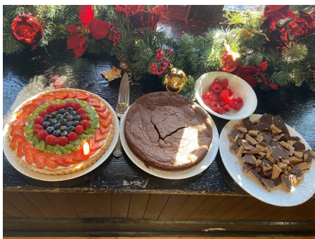
The three Make Ahead Desserts were as beautiful as they were delicious.